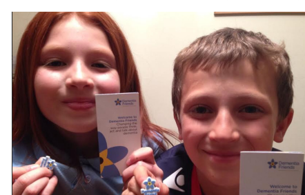
Become a Dementia Friend

Be aware of this as you may need to help in a different way. Allow them to maintain their dignity, self-respect and privacy. Do not take offence if they refuse help at a particular time. Be sure to continue to support. Be prepared to offer again on another occasion.