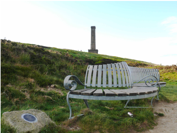
Local views of Peel Tower on Holcombe Hill above Ramsbottom

There is a steam railway run by ELR (East Lancashire Railway) that runs for 12 miles from Heywood to Rawtenstall via Bury. The nearest local station is Summerseat. There are reduced prices for locals. Further details can be found at www.east-lancs-rly.co.uk or call 0161 764 7790